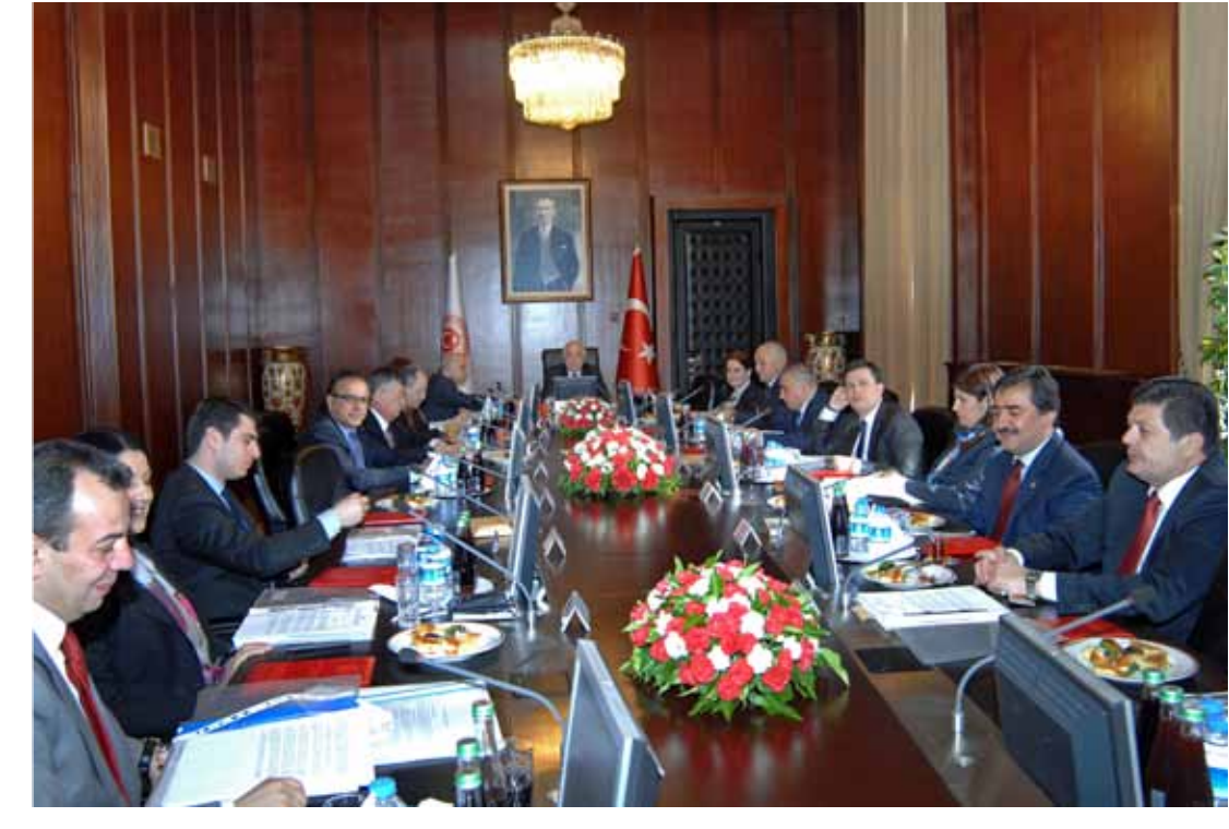
Meeting of the Bureau