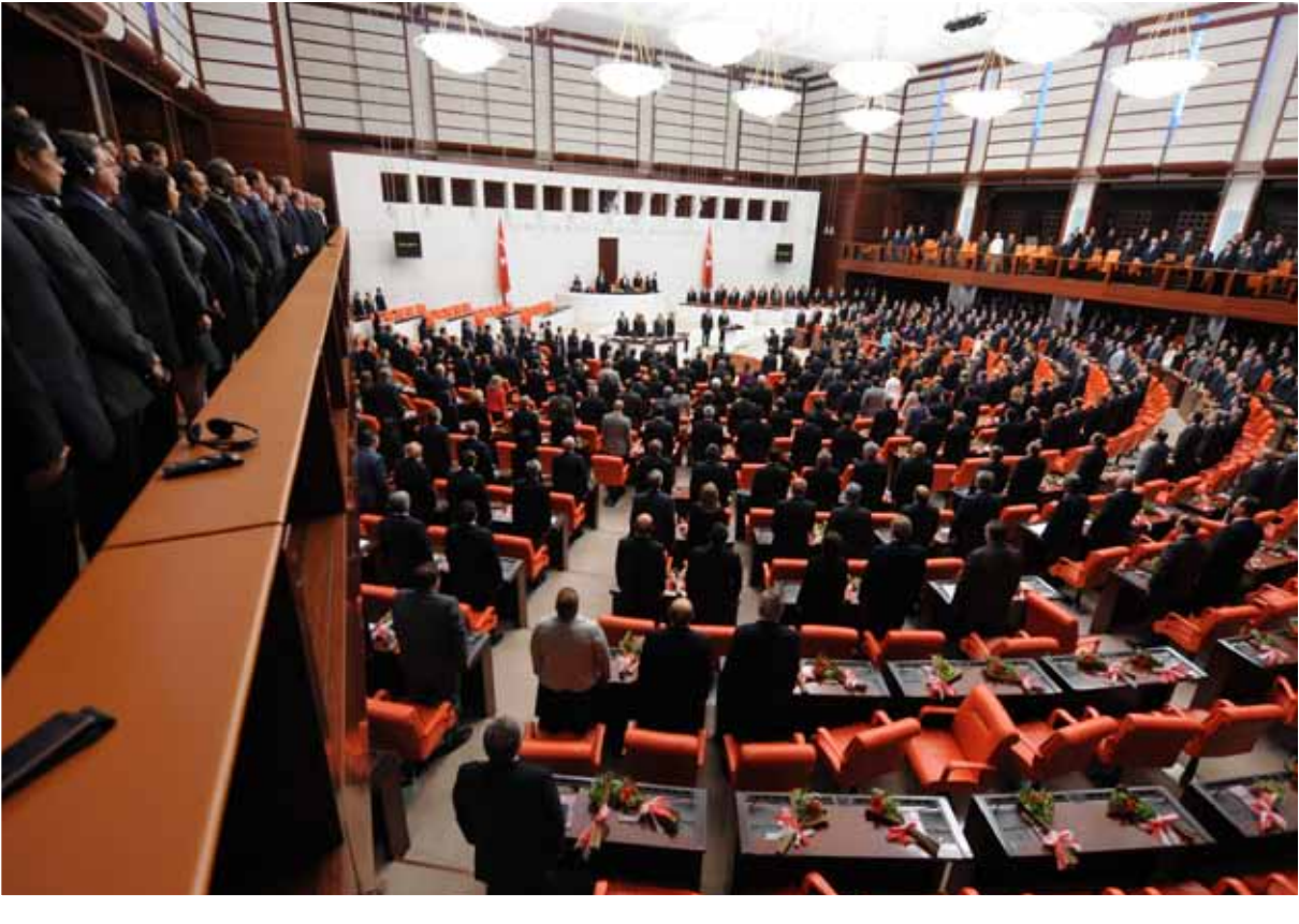
Opening ceremony of the Assembly