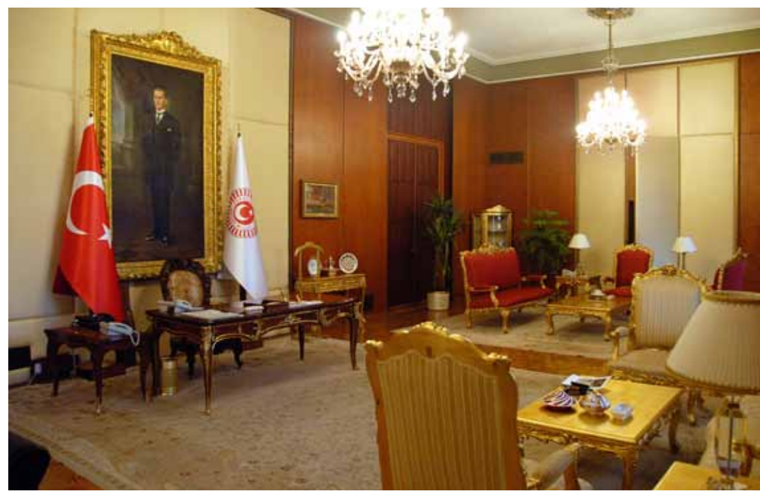
Office of the Speaker

of the Speaker. Political party groups are not permitted to nominate candidates for this election (Art. 94/2, Const.). Nominations must be submitted to the Bureau of the Assembly within five days after the Assembly convenes. The Speaker is elected within five days after the expiration of the nomination period (Art.94/4, Const.).